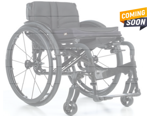
QS5 X - Fixed Front