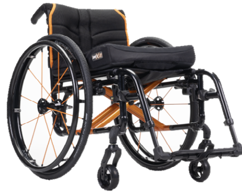
QS5 X - Swing Away