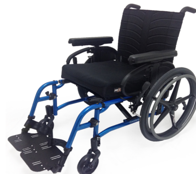
Quickie QX featuring the Jay X2™ cushion