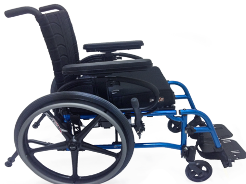
Quickie QX, Ultra Lightweight Folding Wheelchair