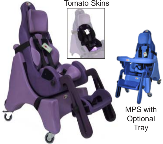
MPS with Optional Tray