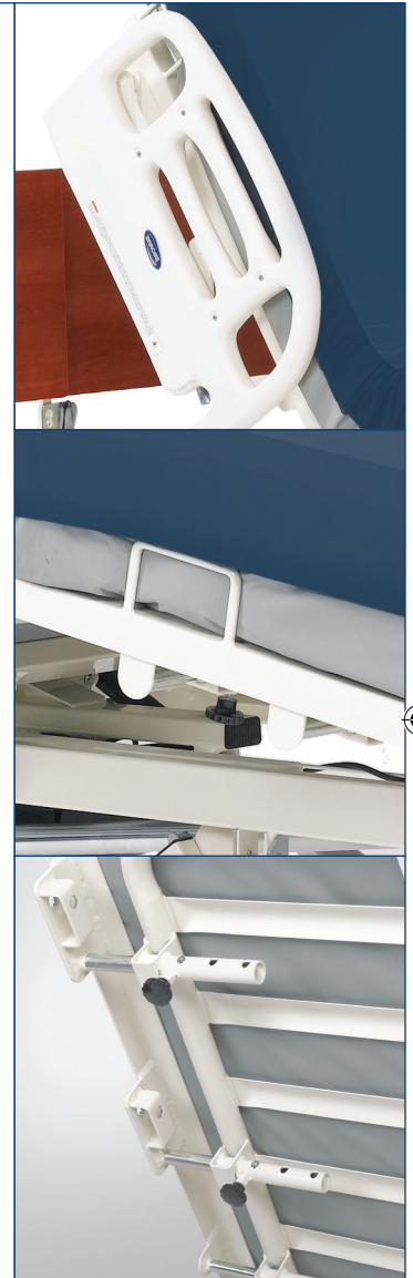
CS9 FX600 bed featured with Invacare® ThinkSoft® Positioning Device, Kendall Bed Ends and Invacare® Solace® Mattress

The innovative Carroll CS Series™ CS9™ FX600 Adjustable Width Bed adjusts from 36" to 39" or 42" to accommodate a variety of residents, offering facilities the utmost in flexibility and providing a total solution for any long-term care facility. Matching the look and feel of the entire CS line, this FX600 is a bariatric bed that blends in with the others, bringing dignity to the resident. The optional trendelenburg option makes this bed a true solution in every wing of the facility.