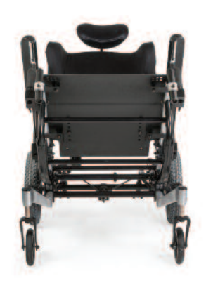
STRUT TUBE TECHNOLOGY