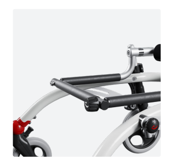
Grip bar 86879-x