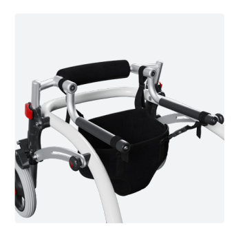
Sling seat 8682x