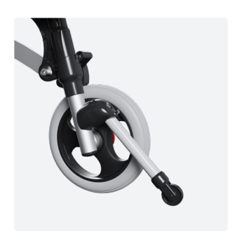
Anti-tips, fixed 86815-F, 86815-3F