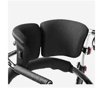
Back support 86886x, 86816