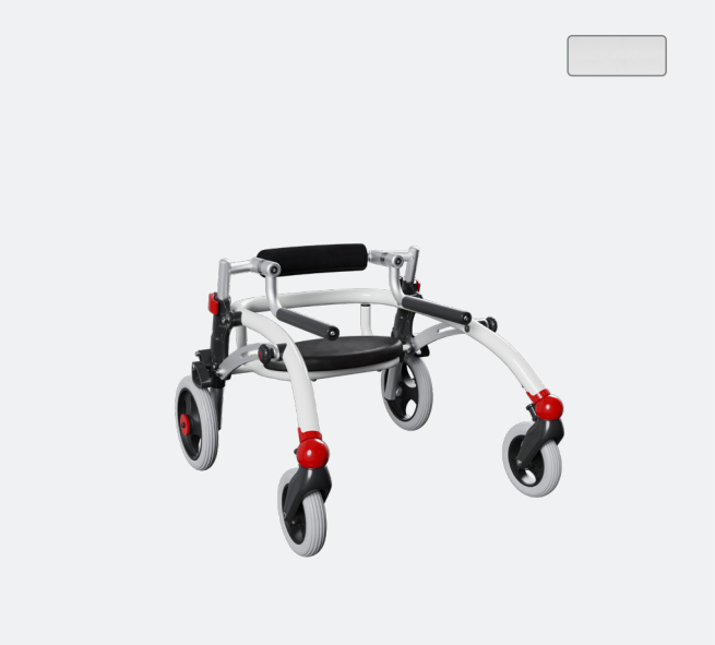
Size 0 Size 1 Available in white Available in yellow