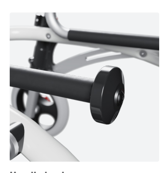
Handle knobs 86861