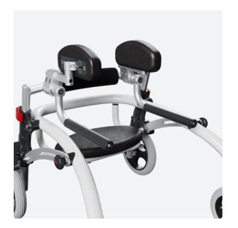
Hip supports 86819