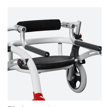
Flip down seat 8682x