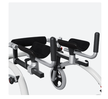
Forearm support w/handgrip 95145-x