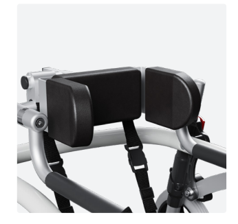
Gator back and side supports