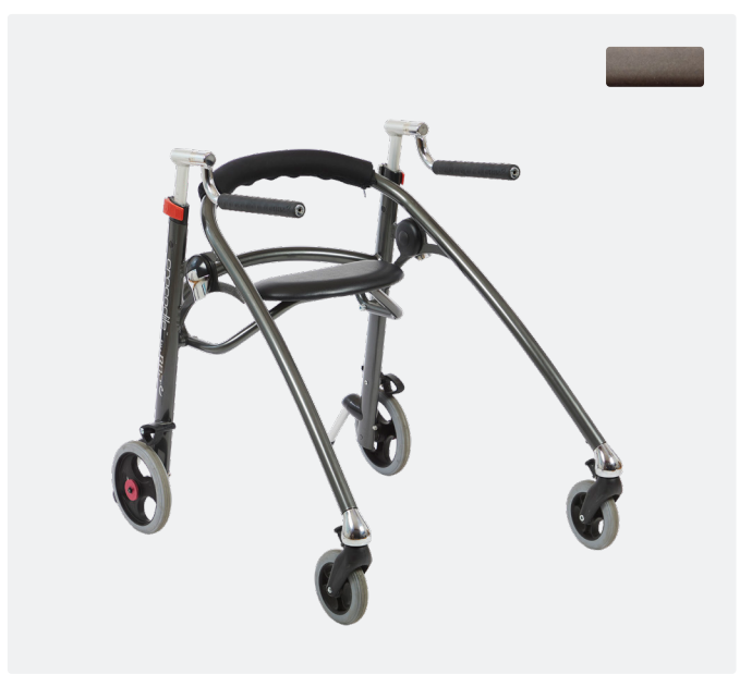
Size 3 Available in anthacite grey