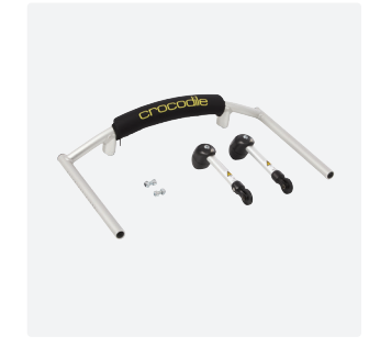
Starter kit 86801-0