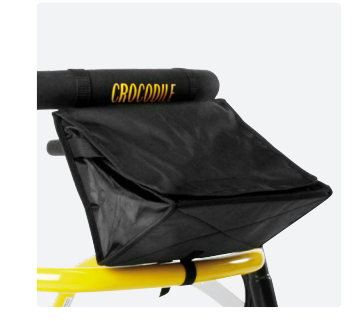
Bag 86839, 86843