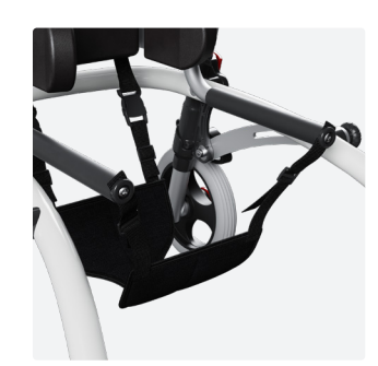
Sling seat, light weight 8682x-1