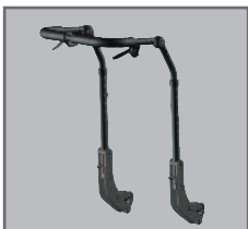
Adjustable Stroller Handle