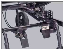
Foot Release Tilt Actuator