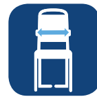
Width between armrests ▼