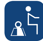
Load capacity ▼