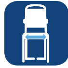
Seat width ▼

For more comprehensive information about this product, including the product's user manual, please visit www.clarkehealthcare.com .