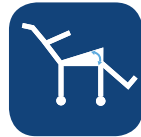
Tilt angle seat ▼