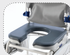
Seating and Backrests