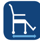
Total depth ▼