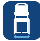
Total width ▼