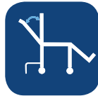
Tilt angle back ▼