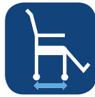
Seat depth ▼