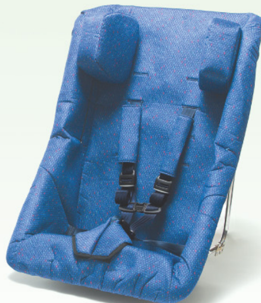
#2500 (65 - 130 lbs capacity)

*#2000 meets or exceeds crash testing requirements in the US (FMVSS #213), Canada (NCSVA #213.3), and Europe (ECE R44.03)