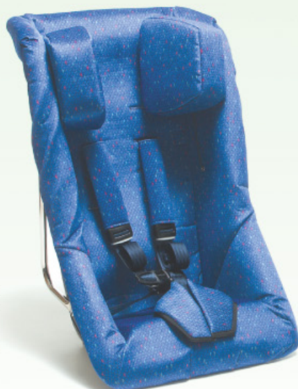
#2000 (20 - 102 lbs capacity)