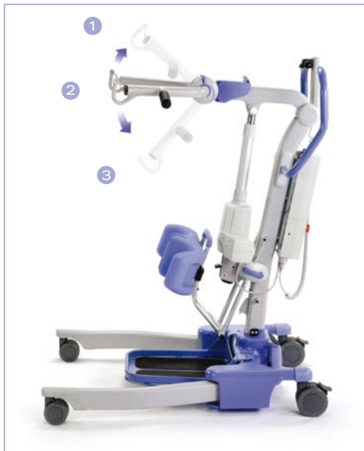
The Journey's three optional cow-horn positions.

With three different cow-horn height options, the Journey can support a wider range of patient heights and sizes. This additional method of adjustment ensures total flexibility for the care-giver.