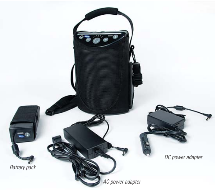
The Invacare® XPO_2^{\mathbb{M}} Portable Concentrator includes the components shown. Other accessories are available separately.