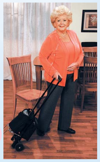
Wheeled cart and accessory bag.