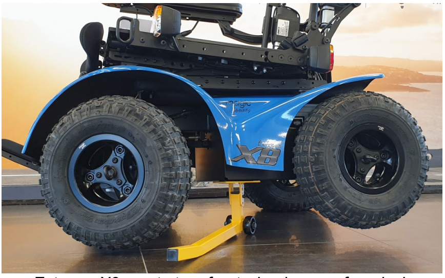
Extreme X8 – note turn front wheels away from jack