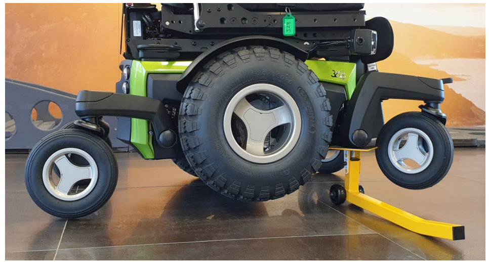
Magic 360 – note under front bogie arm pivot

Lower the wheelchair slowly by lifting the end of the jack, carefully keep hold of the handle in case the wheelchair drops suddenly.