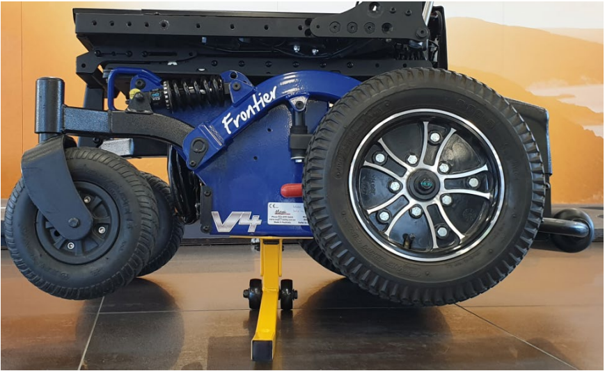
Frontier V4 RWD