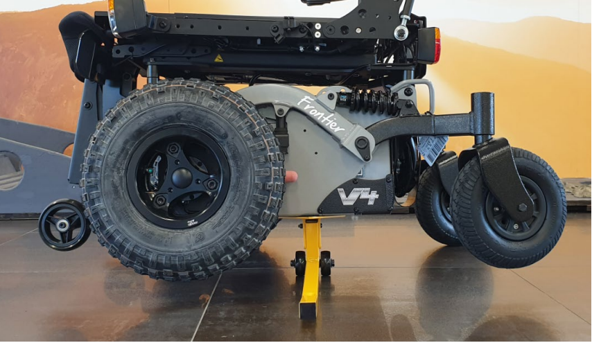
Frontier V4 FWD