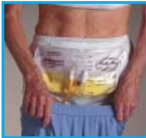
Model is wearing a Belly Bag® filled with 250 ml of water

The Belly Bag® is a urine bag that's worn at the waist. It is designed for either males or females who have an indwelling Foley or suprapubic catheter. The bag fastens around the waist by means of a woven belt with a quick release buckle. It has a 1,000 ml capacity and is completely latex-free. An anti reflux valve behind the catheter port prevents reflux urine flow. The Belly Bag® is emptied by means of a drain tube with a twist valve that is in the approximate position of the urethra. Users can easily sleep with the bag in place, thus it can be worn 24 hours a day. In ambulatory patients, the bag is worn under the clothing where a soft backing provides a comfortable fit.