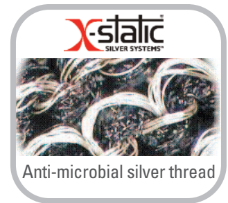
Anti-microbial silver thread