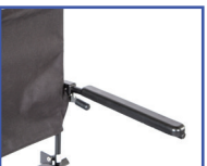
P13615 Left Hand Height-Adjustable Armrest