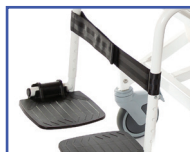
P11117 Calf Strap