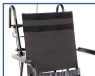
P61057 18"W Adjustable Sling Back