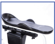
P13613 Left Hand Armrest with Arm Trough