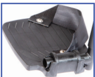
PL11100 Left Foot Plate with Heel Loop