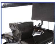
P61056 Abductor/Deflector Small (for 12" and 14" seats)