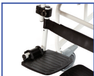
PR13610 Right Pediatric Leg Rest