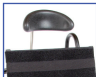
P13621 Head Support Large