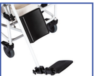
P13583 Right Elevating Leg Rest