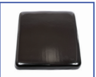
P13617 18"Wx18"D Ensolite® 2" foam Solid Seat