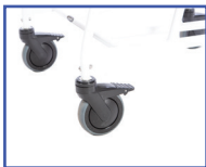
P13770 5" Casters (pair) and 5" Dual Locking Casters (pair)