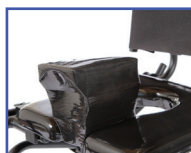
P61006 Abductor/Deflector Large (for 18" seats)