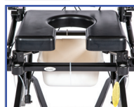
P13619 Pan/Hanger-Fits 12"W and 14"W Frame