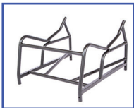
P13623 18"Wx18"D Frame