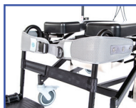
P11114 Bodypoint® Knee Belt