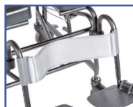
P61081 Bodypoint® Calf Strap