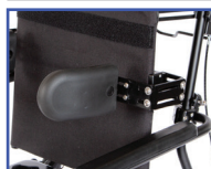
PL13574 Left Hand Swing-Away Adjustable Lateral