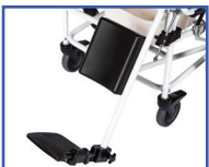
P13582 Left Elevating Leg Rest