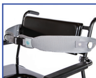
P11113 Bodypoint® Belt w/Quick Release Knobs