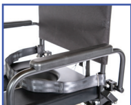
P13611 Left Hand Armrest with Pad