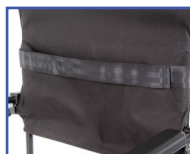
PT60884 Trunk Belt (48" circumference with 12" velcro overlap)