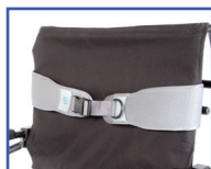
P11093 Bodypoint® Trunk Belt