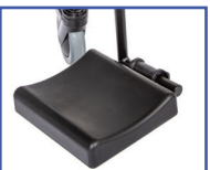
PL11101 Left Padded Foot Plate