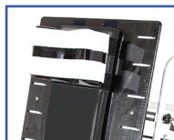
P11105 Head Support Small Foam (only available for P11104)