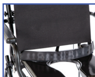
PW60884 Waist Belt (48" circumference with 12" velcro overlap)