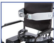
P11116 Bodypoint® Trunk Belt & Waist Belt