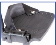
PR11100 Right Foot Plate with Heel Loop