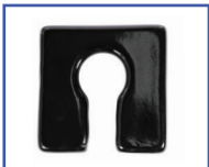
P11090 12"Wx12"D Ensolite® 1" foam Front/Rear Open Seat A-2.5"xB-4.5" opening