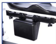
PL13618 Left Hand Arm-Mounted Hip Guide