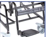
PR13581 Right Gooseneck Leg Rest