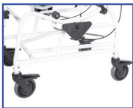
60800-4 5" Dual Locking Casters (2 pair)