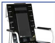
P11104 18"W Solid Back Full Length w/Center Pad (adjustable depth)