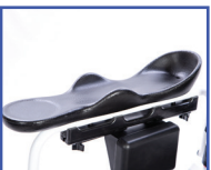
P13614 Right Hand Armrest with Arm Trough