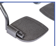
P61138 Right Oversized Aluminum Foot Plate