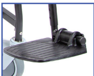
PL11099 Left Foot Plate