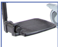
PR11099 Right Foot Plate