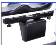
PR13618 Right Hand Arm-Mounted Hip Guide