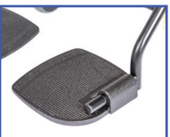
P61137 Left Oversized Aluminum Foot Plate