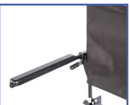
P13616 Right Hand Height-Adjustable Armrest