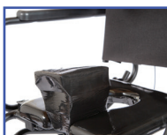
P60756 Abductor/Deflector Medium (for 16" seats)