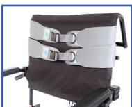
P11102 Bodypoint® Trunk Belt (pair)