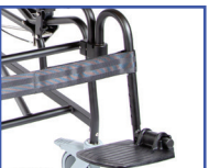
PL13581 Left Gooseneck Leg Rest