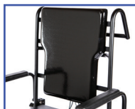
P11107 18"W Solid Back