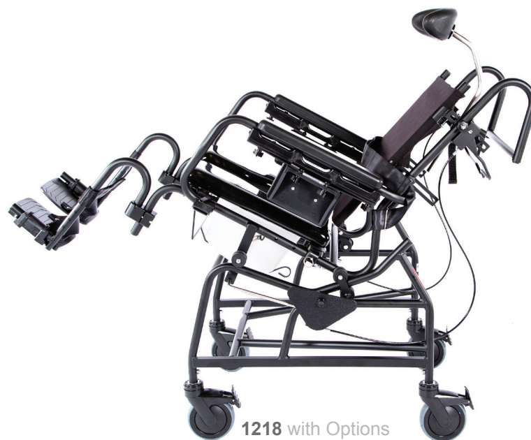
1218 with Options