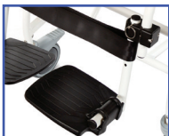
PL13610 Left Pediatric Leg Rest