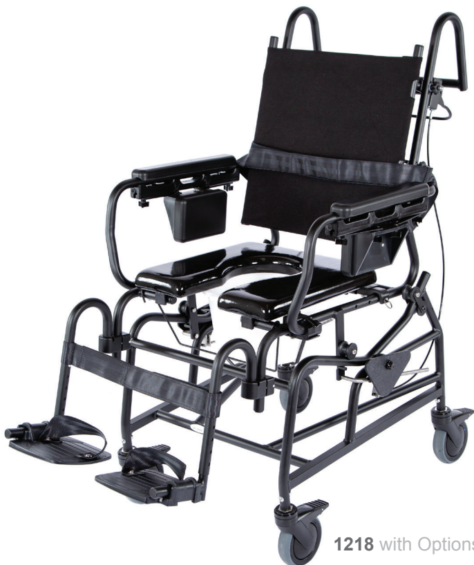
1218 with Options