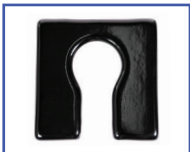
P11091 14"Wx14"D Ensolite® 1" foam Front/Rear Open Seat A-3.5"xB-5.5" opening