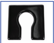
P11092 16"Wx16"D Ensolite® 1" foam Front/Rear Open Seat A-4"xB-6.5" opening