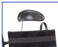
P13622 Head Support Small