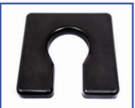
P13494 18"Wx18"D Comfortuff 1.5" waterfall foam Front/Rear Open Seat A-5"xB-8" opening