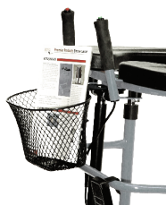
83537 Basket w/Bracket

Sometimes referred to as a “Cardiac Walker”. The Eva® Walker supports the patient’s weight when exercising. Good for Post-op patients when early walking exercise is indicated. Easily adjustable to suit different patient heights. The padded, molded arm pads have a sculpted forearm cutout to keep the arms from sliding off the pads. The arm pads can be removed and are easily cleaned; making it ideal for institutions with a variety of users. Handgrips are a more comfortable round shape and are forward facing, providing a better and more ergonomic grip. Welded steel frame with baked epoxy enamel finish. Non-marring casters with step on wheel locks on the rear casters. Length of adjustable padded armrest is 17 1/2”, and 6 1/2” wide. Width between the armrests can be adjusted from 12”- 19” wide. Step-on locking brakes on two casters.