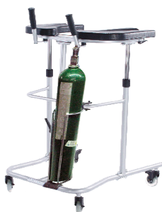
83617 Oxygen Tank Holder