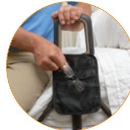
INCLUDES ORGANIZER POUCH