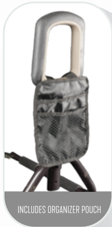
INCLUDES ORGANIZER POUCH