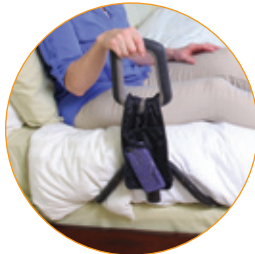
ERGONOMIC HANDLE ALLOWS FOR 2 HANDED GRIP