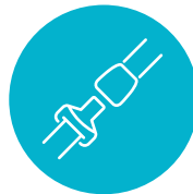
SECURES TO BED FRAME WITH INCLUDED SAFETY STRAP