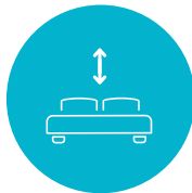
PROVIDES ASSISTANCE IN AND OUT OF BED