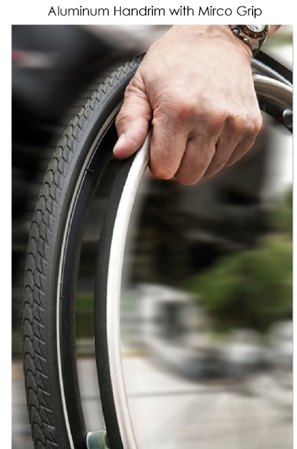
Aluminum Handrim with Micro Grip

For more information see Handrim Hardware Chart . Quantity in Handrim Hardware Kits are for one wheel. <p>Tab mounted handrims must be installed prior to the tire being installed.