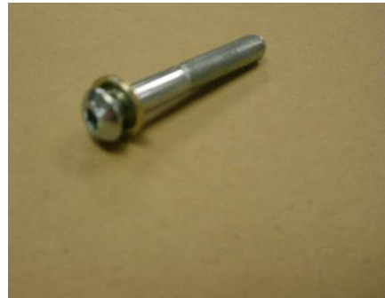
Figure 6: Bolt and washer