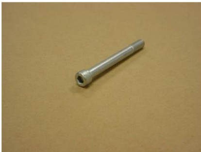
Figure 11: Bolt for rear mount