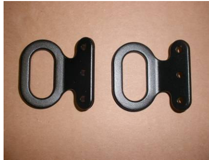
Figure 2: Rear brackets (2 included)