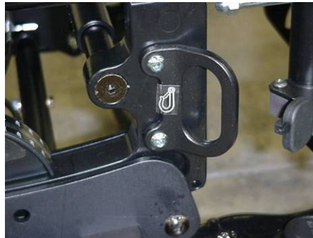
Figure 8: Orientation of front bracket relative to wheelchair