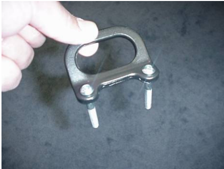
Figure 7: Bolt and washer sets placed on front bracket