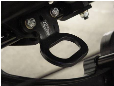
Figure 12: Rear bracket orientation