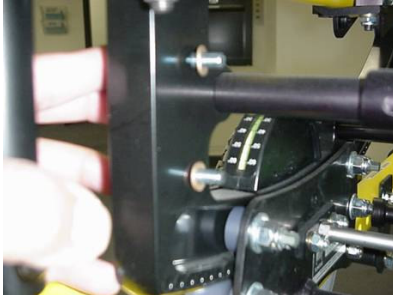
Figure 9: Placing a washer