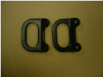
Figure 1: Front brackets (2 included)

Failure to carefully read, understand and follow these instructions could result in severe injuries or death. Please read and understand these instructions before beginning the installation. Before beginning the installation, make sure that all the parts are included. Below is an illustration showing what should be included in the Iris Transit Bracket Kit.