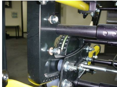
Figure 10: Attaching a 1/4-28 Nylock Nut