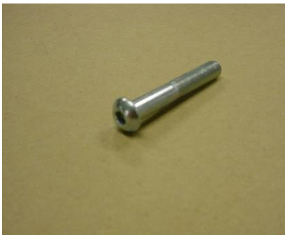
Figure 5: Bolt for front bracket mount