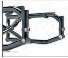
2 HYBRID FRAME DESIGN Eliminates the need for both hemi and standard frame, while providing a complete range of seat-to-floor heights