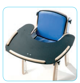
Depth Adjustable Activity Tray 135-X620 Tray Pad (Not shown) 135-X656