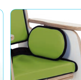
25mm Side Pad (Pair) 135-X635-AA 50mm Side Pad (Pair) 135-X654-AA