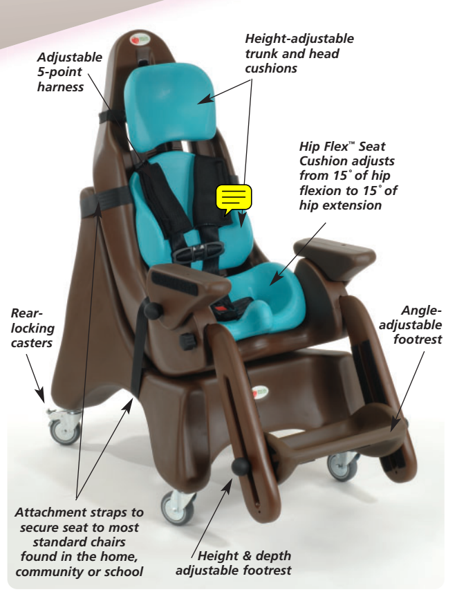
Shown here with Standard Headrest (sold separately)