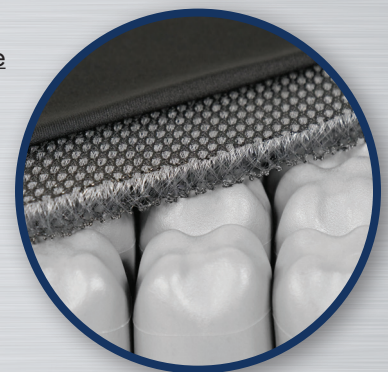
View of 3D mesh

CG Air Deluxe is the tailor-made version that best meets the unique needs of each user. The production of a customized mold allows us to alter cell heights and modify the shape of the cushion's compartments.