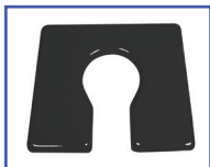
P60903 20"Wx18"D Ensolute® 1" foam Front/Rear Open Seat A-4.5"xB-7.75" opening