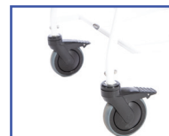
60800-2 5" Dual Locking Casters (pair)