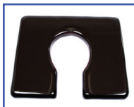
P60905 22"Wx18"D Ensolute® 1" foam Front/Rear Open Seat A-4.5"xB-7.75" opening