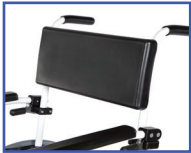
P13713 20"W Solid Back