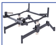
P13722 20"Wx18"D Stainless Steel Frame