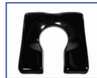
P61058 18"Wx18"D Ensolute® 2" waterfall foam Front Open Contoured Seat A-5.5"xB-8.25" opening