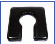
P60913* 18"Wx18"D Ensolute® 2" waterfall foam Front/Rear Open Seat A5.25"xB-8" opening