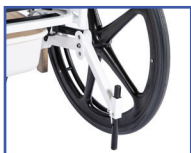
P13708 Bolted Axles with Tipping Levers (pair)