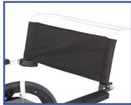
P13712 22"W Sling Back with Stroller Handles