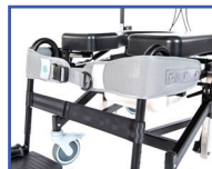
P11114 Bodypoint® Knee Belt