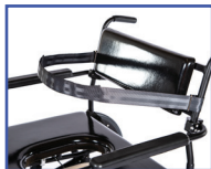
PT60884 Trunk Belt (for 20"W and 22"W frame only, 48" circumference with 12" velcro overlap)