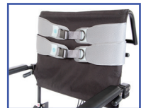
P11102 Bodypoint® Trunk Belt (pair)