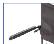
P13616 Right Hand Height-Adjustable Armrest