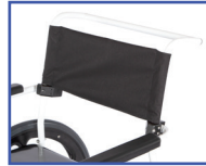
P13690 18"W Sling Back with Stroller Handles