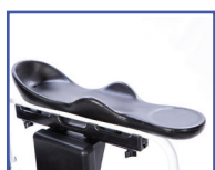
P13717 Left Hand with Arm Trough