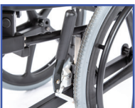
P13724 Wheel Locks with Extended Handle (pair)