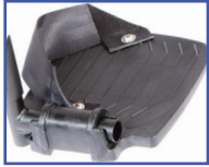
PR11100 Right Foot Plate with Heel Loop