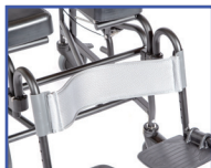
P61081 Bodypoint® Calf Strap