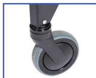
60841-2 5" Casters (pair)