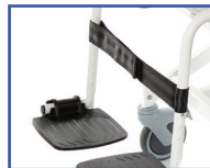
P60879 Calf Strap