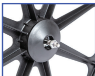
P13707 Quick Release Axles with Tipping Levers (pair)