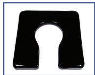
P60850* 18"Wx18"D Ensolute® 1" waterfall foam Front/Rear Open Seat A5"xB-8" opening