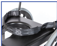
PW60884 Waist Belt (for 20"W and 22"W frame only, 48" circumference with 12" velcro overlap)