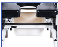
P13719 20"Wx18"D Pan/Hanger