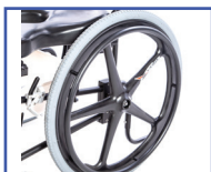
P61059 24" Flat Free Street Tread Wheels (pair)