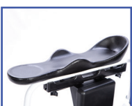
P13718 Right Hand with Arm Trough