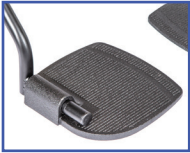
P61138 Right Oversized Aluminum Foot Plate