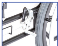
P60532 Wheel Locks (pair)