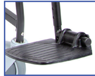
PL11099 Left Foot Plate