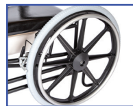
P60549 24" Pneumatic Street Tread Wheels (pair)