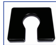
P61038 20"Wx18"D Comfortuff 1.5" waterfall foam Front Open Seat A-5"xB-8" opening