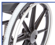
P61103 24" PVC Handrims (replaces standard handrims, pair)