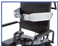
P11103 Bodypoint® Trunk Belt & Waist Belt