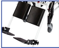
P13571 Left Elevating Leg Rest