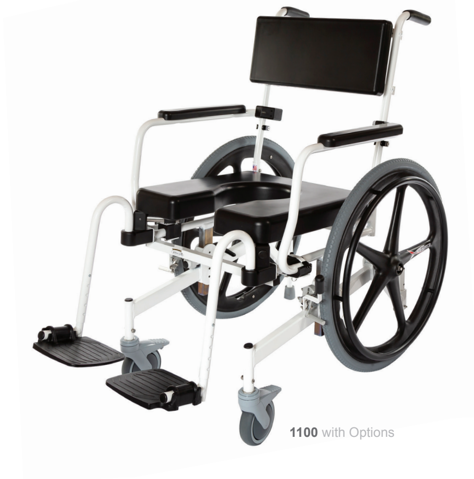
1100 with Options