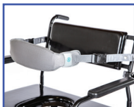
P11112 Bodypoint® XL Trunk Belt