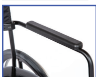
P13715 Left Hand Armrest with Pad