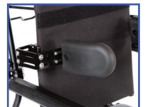
PR13574 Right Hand Swing-Away Adjustable Lateral