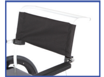
P13692 18"W Sling Back with Stroller Handles (adjustable depth)