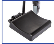
PR11101 Right Padded Foot Plate