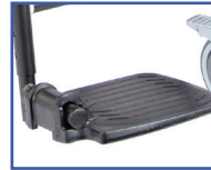
PR11099 Right Foot Plate