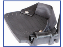
PL11100 Left Foot Plate with Heel Loop