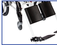
P13572 Right Elevating Leg Rest