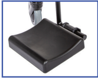
PL11101 Left Padded Foot Plate