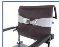
P11093 Bodypoint® Trunk Belt