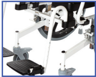
PL13725 Left Leg Rest