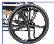
P61096 24" Wheels (pair)