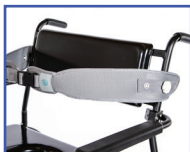
P11113 Belt w/Quick Release Knobs