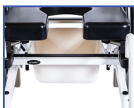
P13376 18"Wx18"D Pan/Hanger