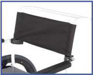
P13710 20"W Sling Back with Stroller Handles