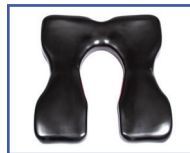
P60974 18"Wx18"D Comfortuff sloped foam Front Open Seat A-4"xB-6.5" opening