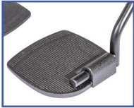
P61137 Left Oversized Aluminum Foot Plate