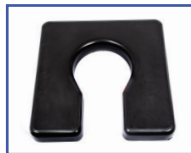
P60993* 18"Wx18"D Comfortuff 1.5" waterfall foam Front/Rear Open Seat A-5"xB-8" opening