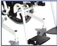
PR13725 Right Leg Rest