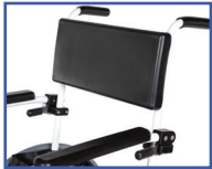
P13691 18"W Solid Back