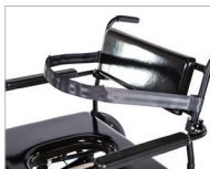
PT60909 Trunk Belt (for 18"W frame only, 48" circumference with 12" velcro overlap)