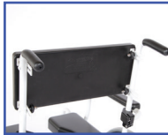
P13693 18"W Solid Back (adjustable depth)