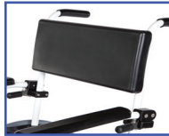
P13714 22"W Solid Back