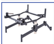
P13721 18"Wx18"D Stainless Steel Frame