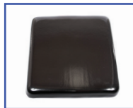
P61086 18"Wx18"D Ensolute® 2" foam Solid Seat