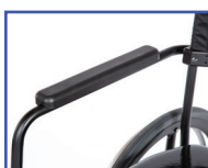
P13716 Right Hand Armrest with Pad