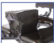
P61006 Abductor/Deflector Large