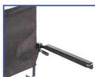
P13615 Left Hand Height-Adjustable Armrest