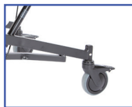
60800-2 5" Dual Locking Casters (pair)