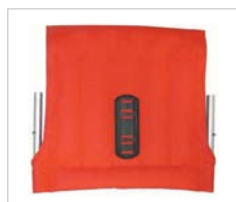
SEAT EXTENSION KIT