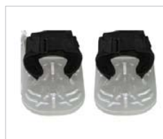
HEEL LOOPS/ANKLE CUFFS