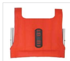
SEAT DEPTH REDUCTION KIT