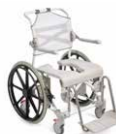
Etac Swift Mobil 24"-2