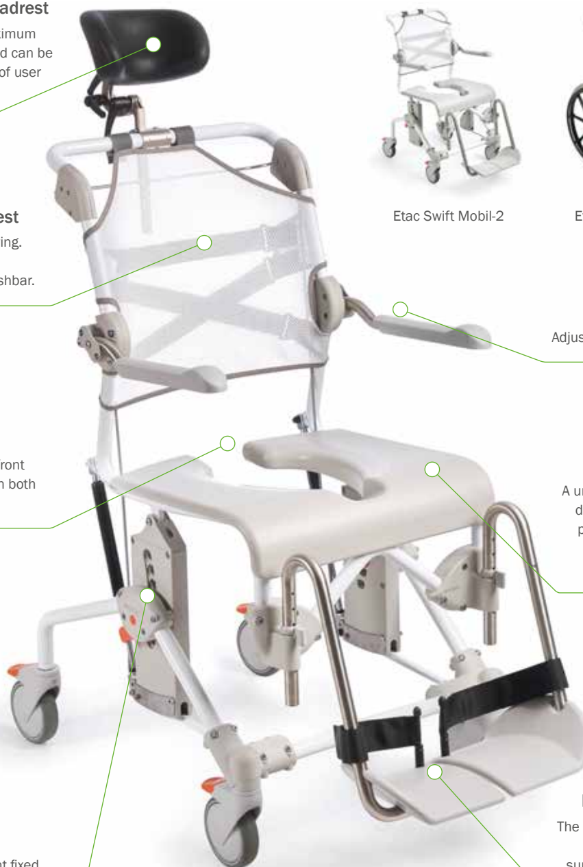
Etac Swift Mobil Tilt-2

The gently curved footplates provide instep and arch support, ensuring comfort, stability and relaxation.