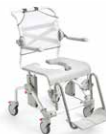
Etac Swift Mobil-2

Easy to adjust to different fixed seat heights, without using tools.