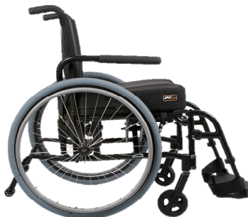
Quickie QXi, Ultra Lightweight Adjustable Folding Wheelchair