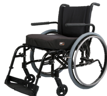
Quickie QXi featuring the Jay ION™ cushion